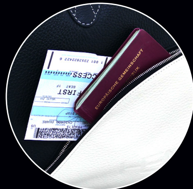
External passport and ticket pocket