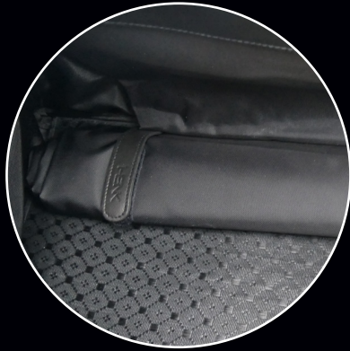
Roll-out/roll-up holder for soiled items inside