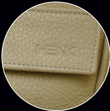
Side pocket: Logo or monogram embossed or embroidered