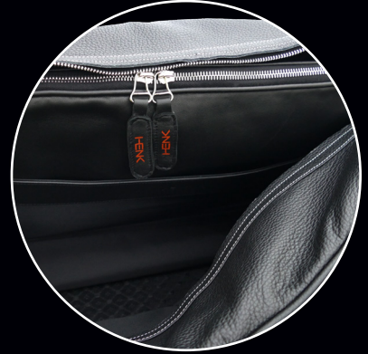
Space for 15" laptop