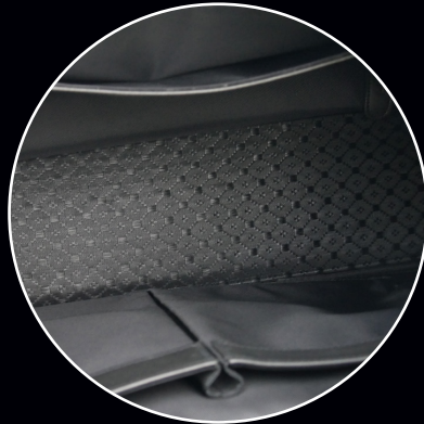
Handwoven horsehair for the bottom