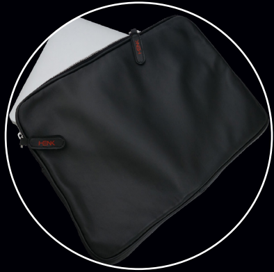
Optionally available 15" laptop bag