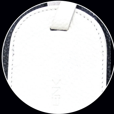
Decorative address tag