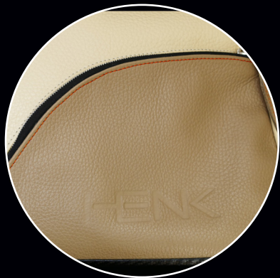
Front pocket: Logo or monogram embossed or embroidered