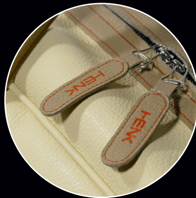
Zipper: Logo or monogram embossed or embroidered